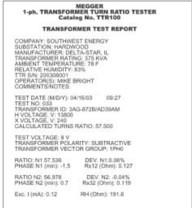
Figure 1: Sample Single-phase three-wire series connection transformer test report

Rugged semi-hard padded case for storing/shipping the instrument, all leads and other accessories.