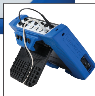
Easle and Wire Management

Innovative Package & Wide Screen 7" color, wide screen touch display. 40% larger than before - the largest in the industry!