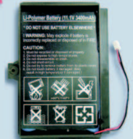
Rechargeable Lithium Battery